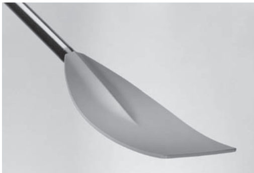
^ Macon Blade