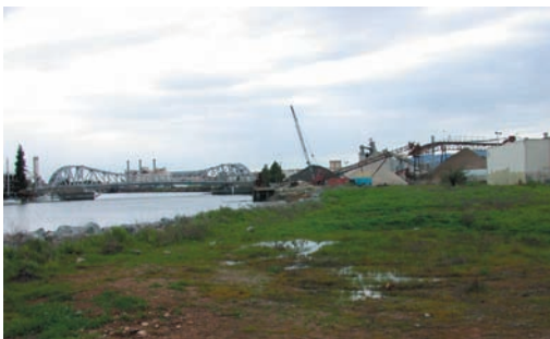
^ View of Tidewater site